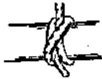
Clove Hitch First Class