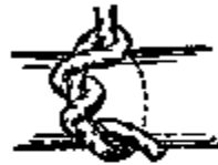
Timber Hitch First Class